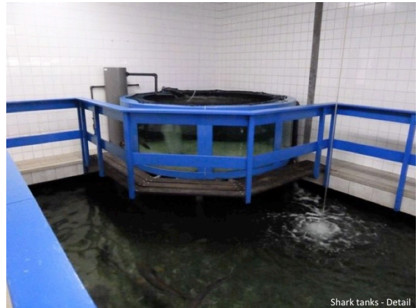
Shark tanks - Detail

Schmidt: Do you advise curators on stocking and suitable species?