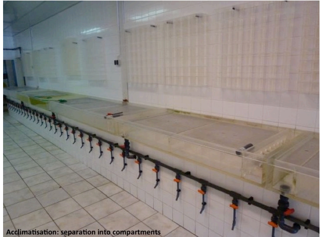
Acclimatisation: separation into compartments